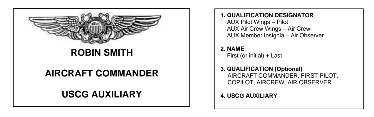
Figure 2 – Auxiliary Flight Suit Left Breast Patch