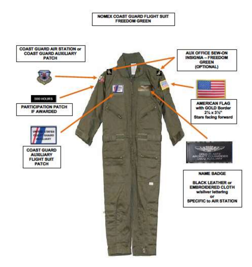
Figure 7 – United States Coast Guard Auxiliary Flight Suit