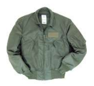
Figure 9 - Flight Jackets for Auxiliary Aviation