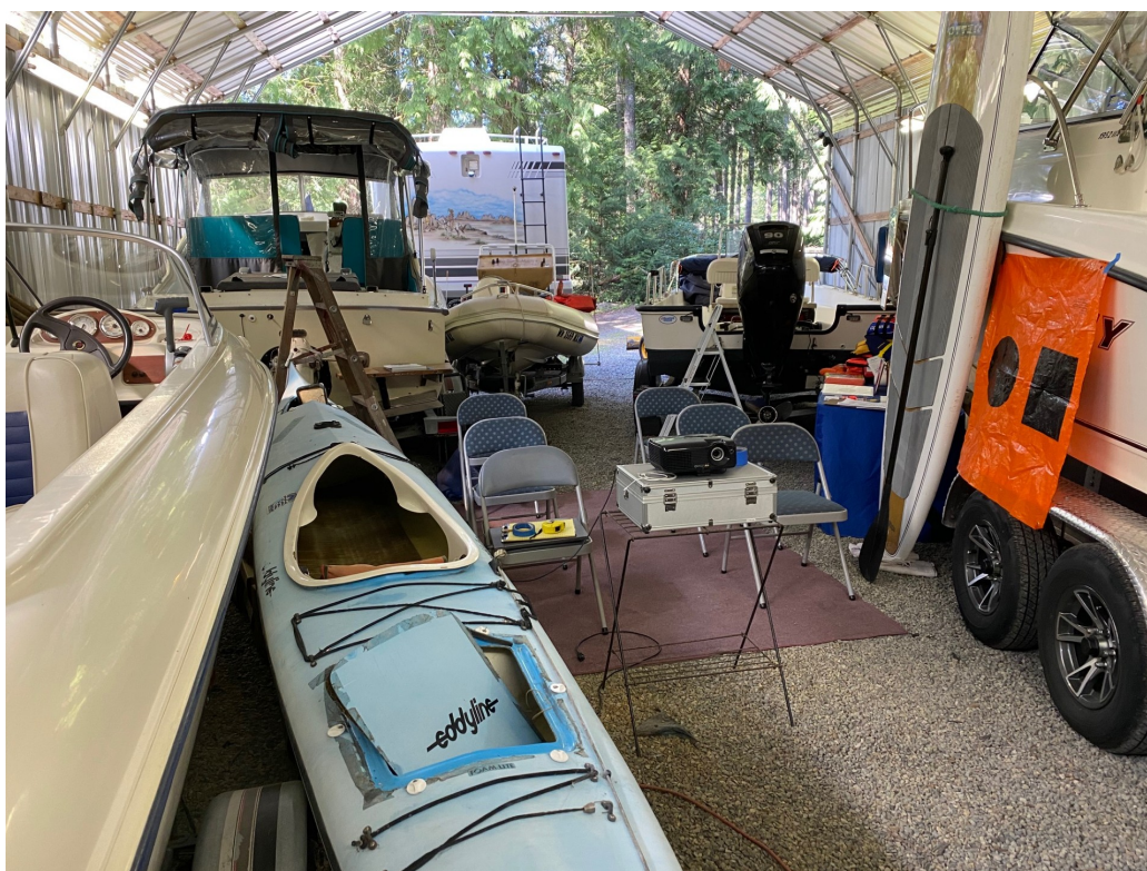
VE Academy