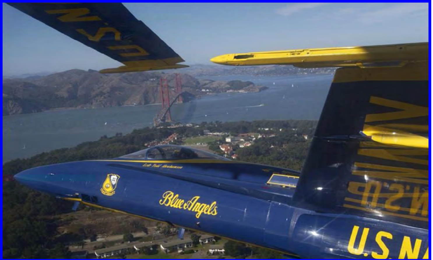
F-18 Cockpit photo #2 wingman Blue Angel Diamond, Fleetweek San Francisco (File photo)