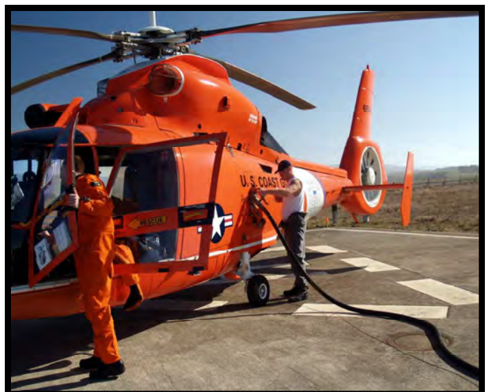
Coast Guard HH-65 helicopter from Air Station Humboldt Bay refuels at Point Arena