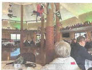
THE MEMBERS WERE WELCOMING. GOOD PEOPLE