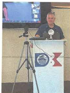
MY GOAL: SAFE BOATING-ALWAYS