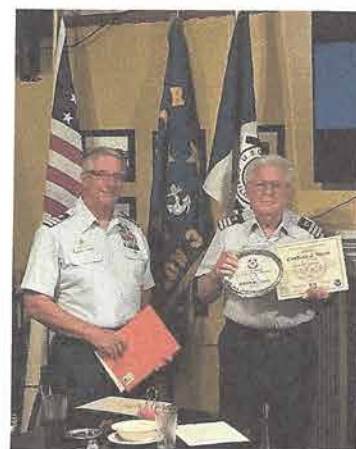
THE ATON MAN HIMSELF