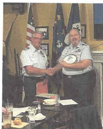
GET 'ER DONE BOSS