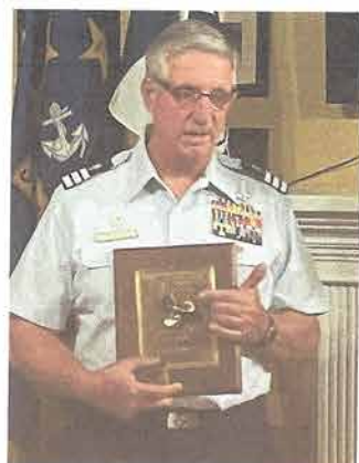
THERE ARE AWARDS AND THERE ARE AWARDS!