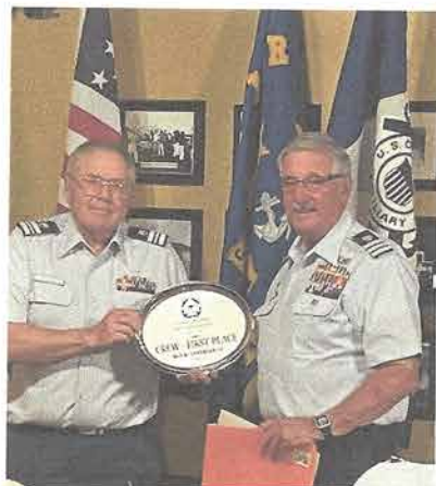
A BLUE RIBBON EFFORT BZ