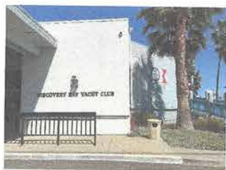
A GREAT MARINA, HOSTS, MEMBERS, AND NEED. THE WEATHER WASN'T BAD EITHER