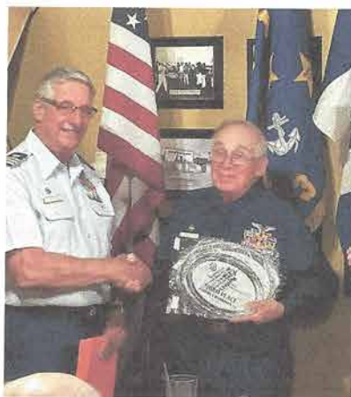
WHEN DOES HE SLEEP?