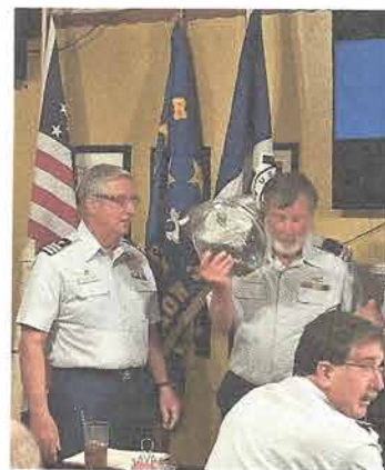
Well Done, Skipper!