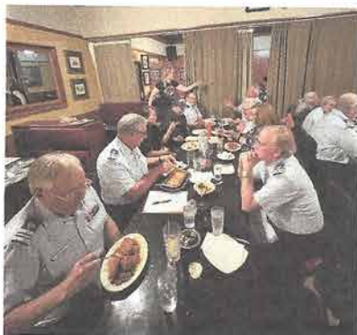
I'm starving! Where is my food!!