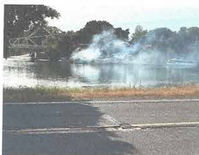
SOMEONE'S HAVING A BAD DAY. JUST DOWN RIVER FROM THE PAINTERSVILLE BRIDGE

Auxiliarists, whether on a patrol, checking a bridge, spotting activity from the air, helping out at a trade show, conducting vessel exams, visiting with our network of Marine Dealers, attending an awards banquet, working a comms facility, teaching a class, cleaning up litter, participating in a parade or a solemn service, or acting as a force multiplier for our Gold Side Brothers and Sisters, must be ever mindful of the words of the Pledge we swore upon admission to our Organization: "I solemnly and sincerely pledge myself to support the United States Coast Guard Auxiliary and its purposes, to faithfully execute my duties, and to abide by the governing policies established by the Commandant of the United States Coast Guard."