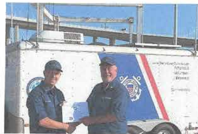
A WELL-DESERVED AWARD COMMUNICATIONS EXPERTISE IS CRITICAL