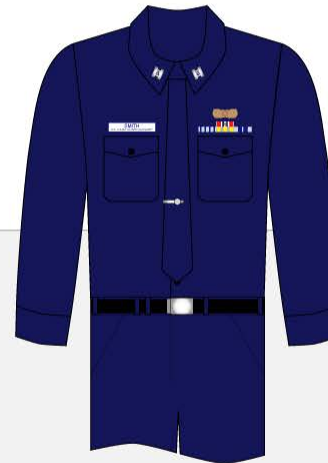
WINTER DRESS BLUE