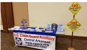
Auxiliary Display. Center on September 18 th.