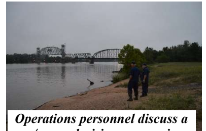
Operations personnel discuss a go/no-go decision concerning underway operations.

Members conducted drills simulating the response to a flooding event on the Arkansas River.