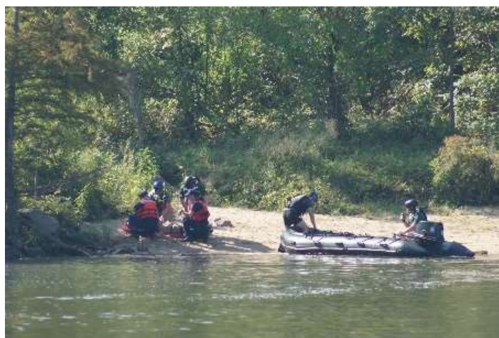
The "victim" of a simulated airplane crash is treated on the shore of the Arkansas River by Coast Guard Auxiliary and Metropolitan Emergency Services personnel.

On September 23 rd several dozen members of Division 15 started their morning responding to a report of a boat with smoke billowing from it downriver from the I-30 bridge.