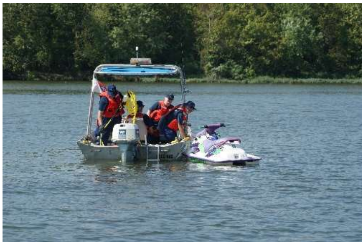
A Coast Guard Auxiliary boatcrew takes a PWC in tow.

Metropolitan Emergency Services (MEMS), the organization that operates ambulance services for several Central Arkansas cities, planned the training evolutions with the goal of presenting Auxiliary boatcrews with situations that they could expect to face during a routine patrol on the Arkansas River. MEMS also and arranged for