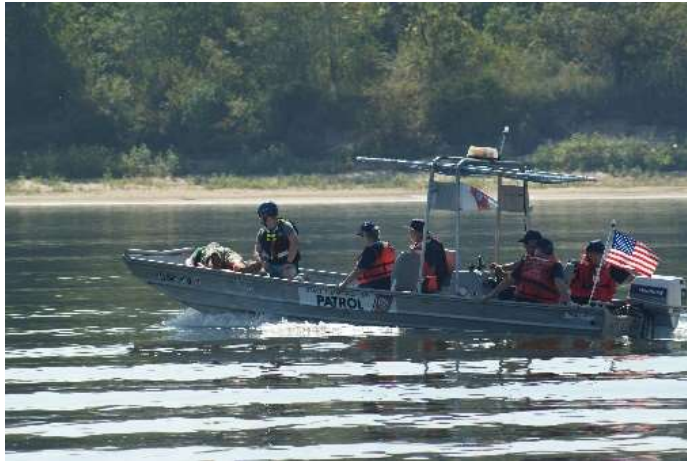
The "victim" of a simulated airplane crash on the Arkansas River is transported to safety by a Coast Guard Auxiliary boatcrew with the assistance of a medic from Metropolitan Emergency Services.