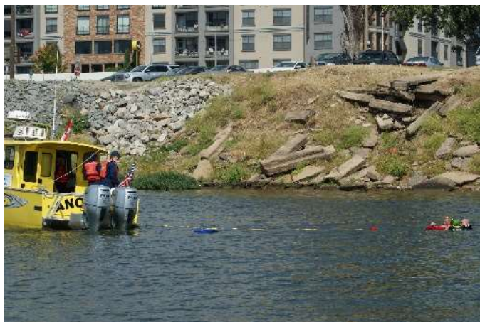
Coast Guard Auxiliary boatcrew members throw a line to assist persons in the water. Metropolitan Emergency Services personnel served in the role of victims and increased the difficulty of the task by simulating being highly intoxicated.

On the night prior to the exercise several Auxiliary facilities took members from around the Division on an Aid to Navigation patrol on the Arkansas River which was made difficult by the moonless