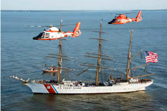
Coast Guard ship "Eagle" surrounded by Coast Guard patrol boats and helicopters.

https://www.military.com/coast-guard-birthday