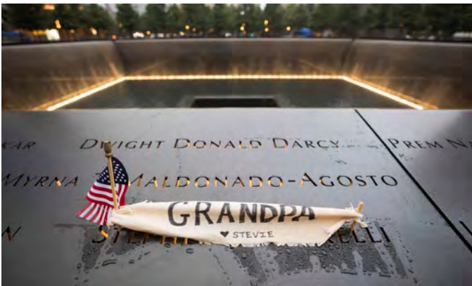
Below: New York, 9/11 Memorial

At ground zero on 9/11 Auxiliaries distributed face-masks and gloves, along with food and water to rescue personnel. On the water Coast Guard Auxiliary boats from Westchester County ran