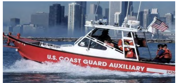
U.S. Coast Guard Auxiliary Patrol Boat on the Water