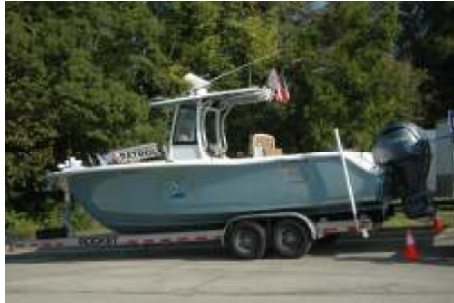
Tail Walker Too on Display at Lawrence Safety Day

Of course Theodore Edward Bear (AKA Ted E. Bear) drew plenty of attention from the children passing by. That gave us a chance to tell people what we do on local lakes and the Ohio River.