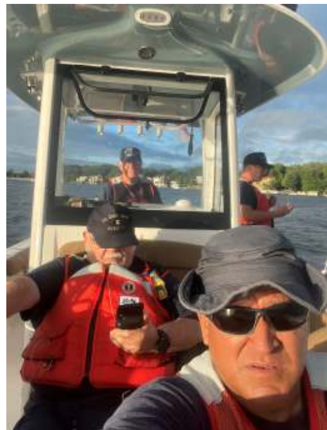
On Station With Coxswain and Boat Crew