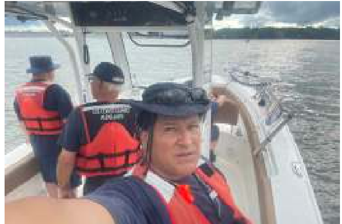
The View of the Coxswain