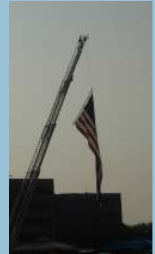
Carmel Fire Department Displaying U.S. Flag