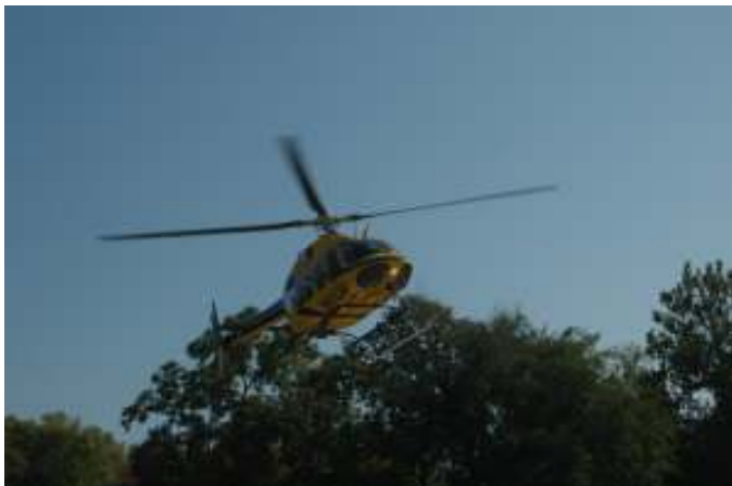
Helicopter (AKA Rotary Wing Aircraft) Arriving

This was a full day of fun and learning for young children as well as those a little older. This was the first year we attended. Last year a lightning storm kept us away until this year.