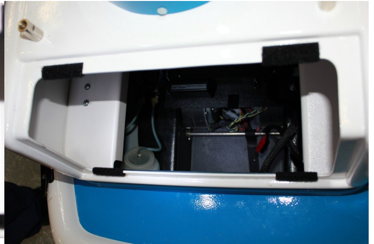
Always remove battery for transportation.