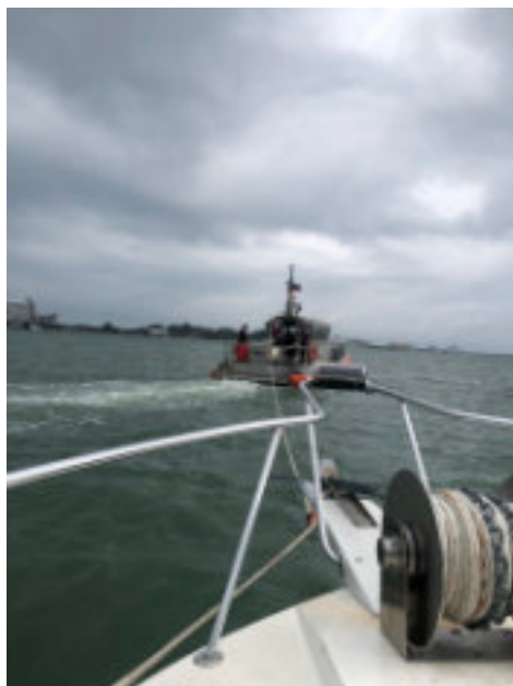
Two boat training showing towing technique