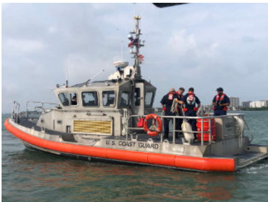
Coast Guard Response boat