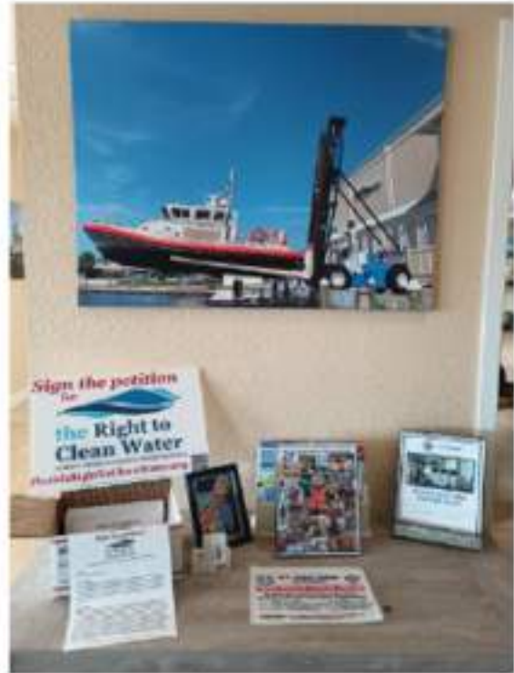
National Safe Boating Week display at Marker 1 Marina