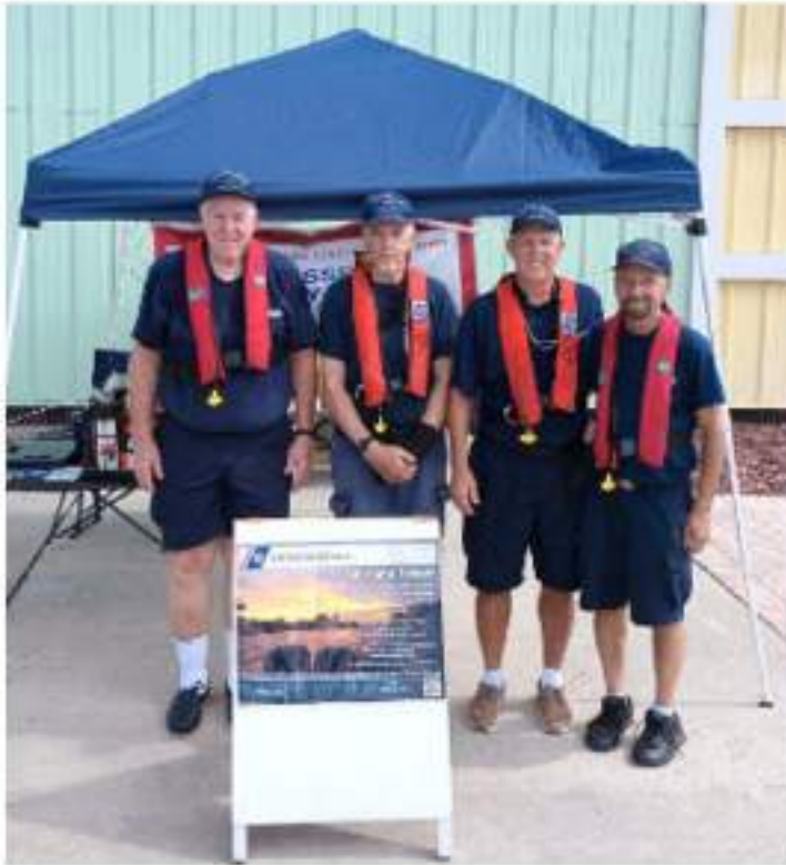
Vessel examiners from left to right: