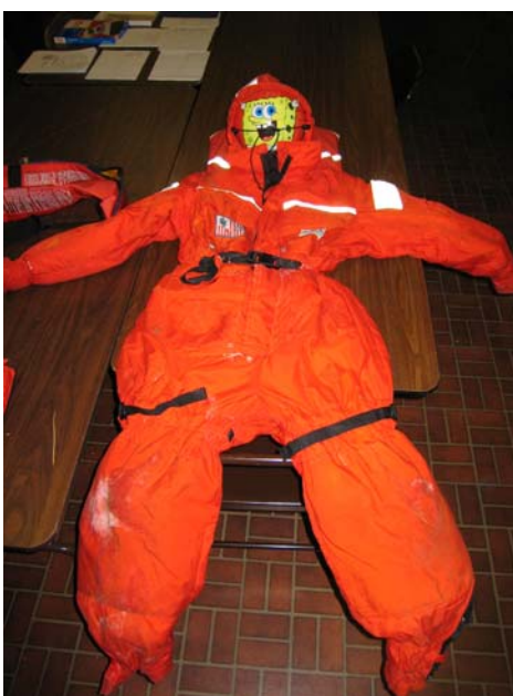
Division members who attended the SAR Training exercise on August 4th will remember "Oscar", who was used during the man over-board portions of the training.

Member training is an on-going effort. In addition to the AUXOP Patrol class scheduled every Wednesday night at 1930 at Flotilla 72, other member training already on our calendar in the coming weeks include the Team Coordination Training (TCT) on Saturday, November 10th at 0900 at Flotilla 79, and the TCT Refresher Seminar at 1930 at Flotilla 73.