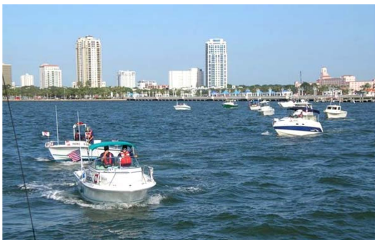
Photo of Auxiliary vessels approaching the reviewing stand