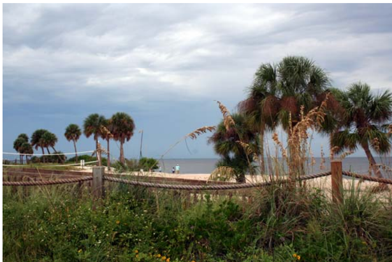
Simmons Park. Is this place beautiful, or what?