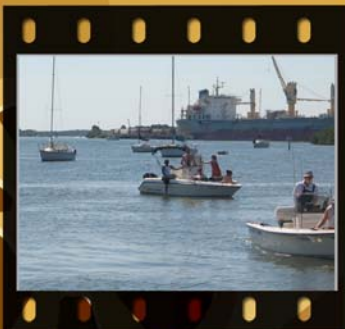
Another broken boat towed in by a good Samaritan..