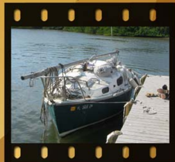
...then crazy guy tied sailboat to active dock and disappeared.

On March 2nd, five members of FL 75 completed ten vessel exams, handed out thirty packets of boating and safety information, and told countless kids how cool they looked in their life jackets .