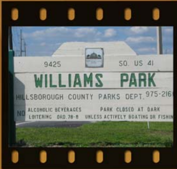
Williams Park, busy day- boats, trailers, boaters, boaters everywhere!