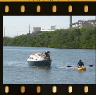
Crazy man towing sailboat with a KAYAK! Should have seen him paddle!