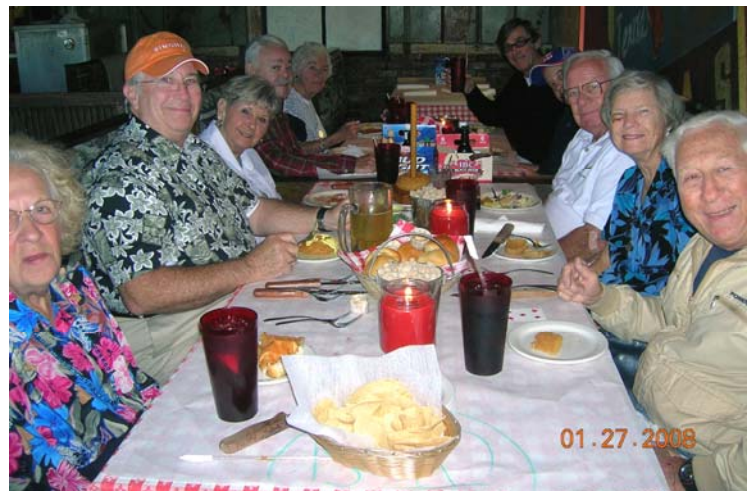
January's event at Cody's

I have flyers on upcoming events. Those interested, please contact me.☀