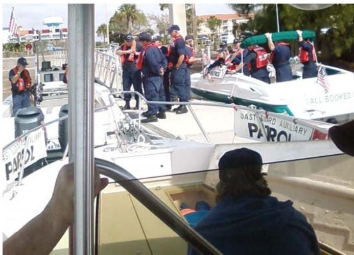
The vessels prepare to launch for a Saturday morning training mission.