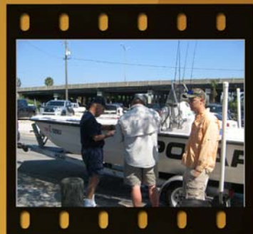
These civilians towed in a broken down vessel with 5 POB*. I gave them a big ATTABOY, and a free VE!