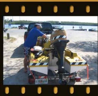
A jet ski with an outboard engine. I see a prop strike is in his Future...Ouch!