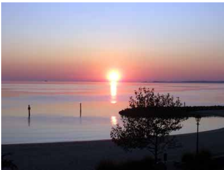
Above: Sunset on the York River in Virginia.