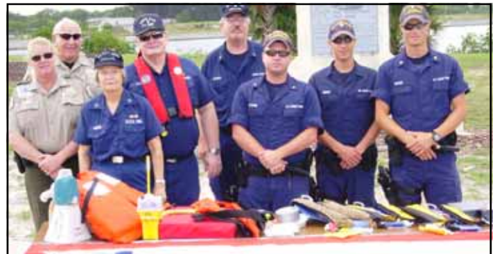
NSBW 2009 FWC, Coast Guard and Coast Guard Auxiliary participants.