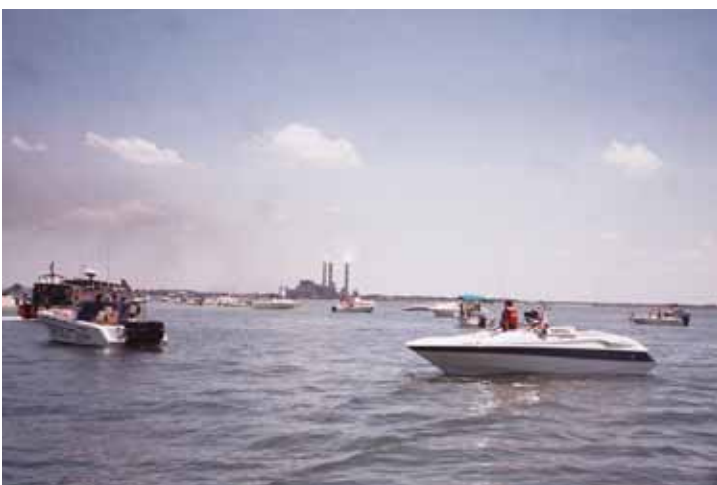
Auxiliary vessel ALL Booked Up and its crew maintaining a safety zone to keep curious onlookers from entering the rescue scene.

scene to take victims to local area hospitals, followed by a U.S. Coast Guard helicopter. Hillsborough County Fire Rescue transported less critical victims back to the dock while Tampa Fire Rescue extinguished the fire.