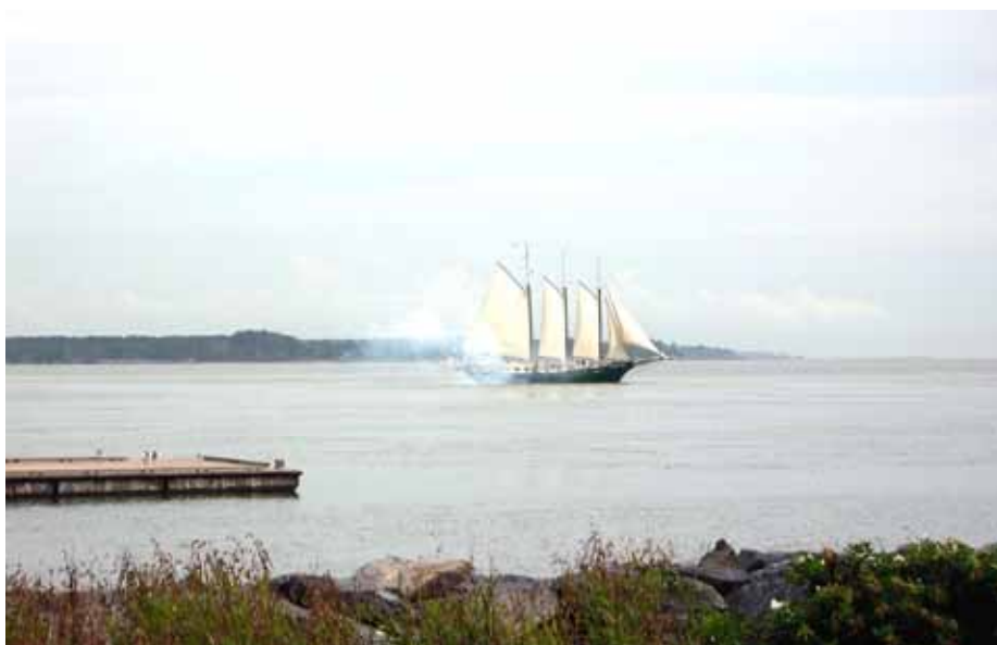
Below: Sailing vessel Alliance fires her canons on the York River.