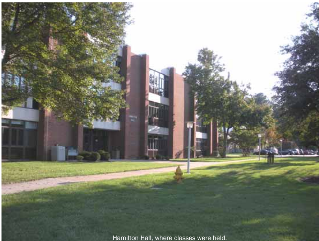
Hamilton Hall, where classes were held.