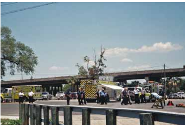
Hillsborough County Fire Rescue at Williams Park prepared to receive victims from the burning boat. The more seriously injured were transported by emergency helicopters to local area hospitals.

Once the Auxiliary vessels were released from the scene they made their way back to Williams Park. There, Hillsborough County Fire Rescue had several ambulances staged awaiting the arrival of victims. ✦