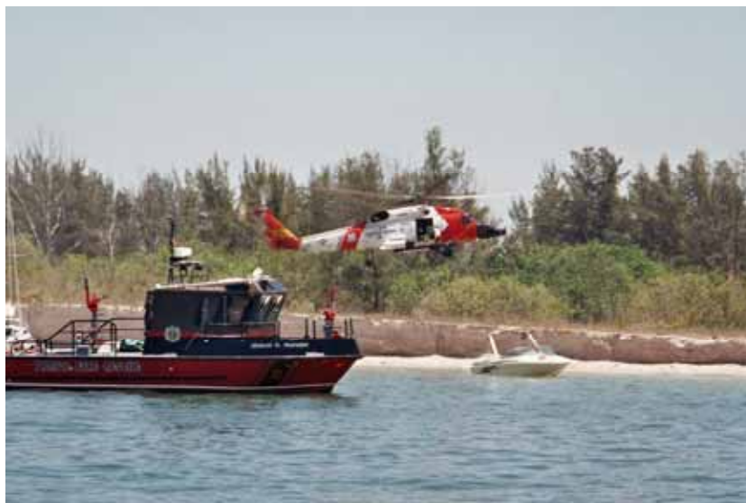
A USCG helicopter flies over Tampa Fire Rescue as it prepares to land on the island.

The victims were already on the beach receiving emergency treatment for their injuries beneath the thick plume of black smoke from the burning vessel. At that point, the Auxiliary vessel's mission changed from search and rescue to securing the area to keep the pleasure boaters and onlookers at a safe distance. Within the next 20 or 30 minutes, the waters around the beach filled with police, sheriff, and fire-rescue boats. A civilian medical helicopter landed on