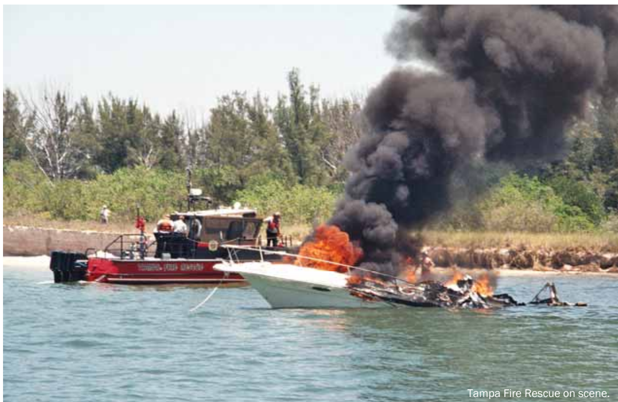
Tampa Fire Rescue on scene.