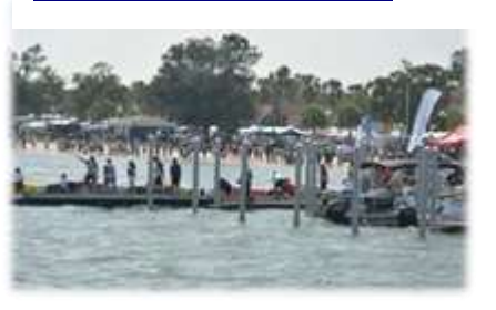
Sunday, July 01, 2018

http://www.gulfportgrandprix.com/environmental-information/