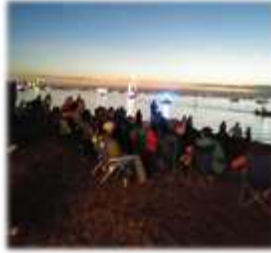
Great turn out!