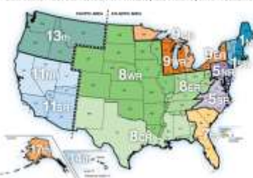
U.S. COAST GUARD AUXILIARY AREAS, DISTRICTS, AND REGIONS