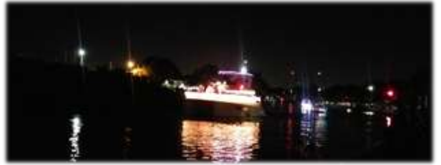
Wonderful Boat PARADE!!