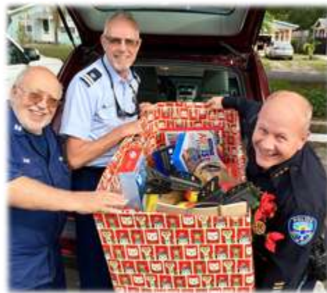
We also collected toys for the 26th annual Operation Santa program sponsored by the Gulfport Police Department.

A Big Thank you to ALL!!! Join Us Next Year!!! We will do it AGAIN!!!