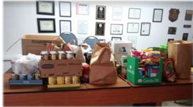
We collected 400lbs of food for the Gulfport Senior Center.