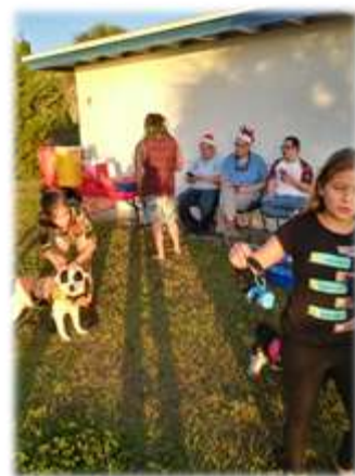
Hot Chocolate & Cookies for all!!