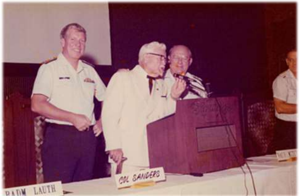
Colonel Sanders, Kentucky Fried Chicken founder, speaking to Coast Guard Auxiliary members.