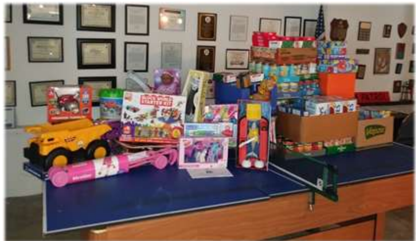
Then the donations came!