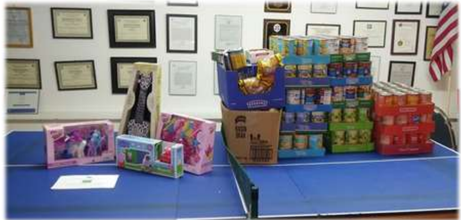
We started right after Thanksgiving!