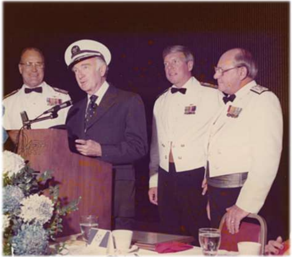
News Journalist Walter Cronkite being named Honorary National Commodore in 1977 by the U.S. Coast Guard Auxiliary.