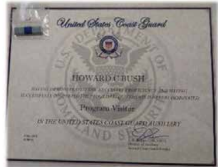
Howard Bush, Program Visits