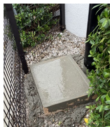
new concrete base for antenna