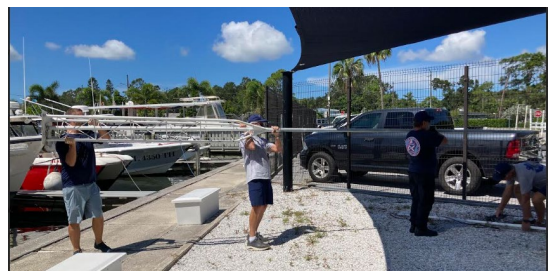
tower relocating to new home