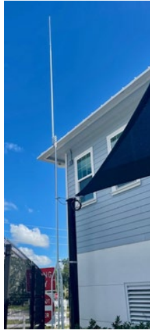
The antenna is raised!