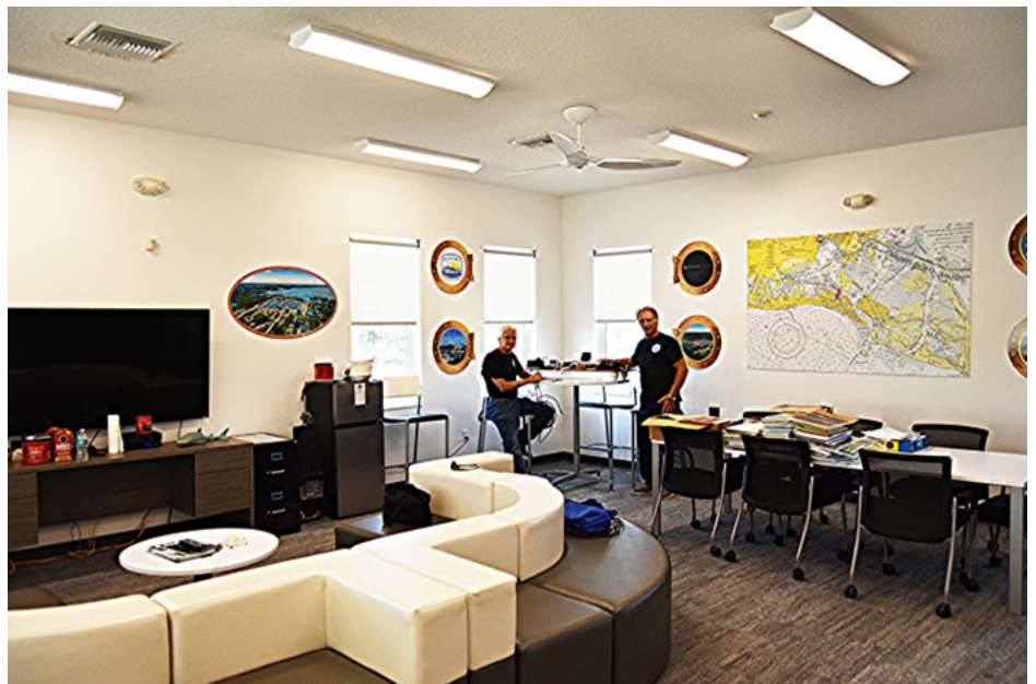
Gulfport Radio's shared space with the Gulfport Marina, but what a space it is! Fridge, coffee maker, comfy seats, big screen, and a table. Still some arranging to do, but only after the City of Gulfport (FL) finishes its own remodel.