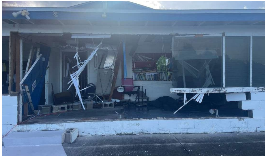
The morning after Helene.

The new building was used by Flotilla 070-07-16 until unfortunately severely damaged by Hurricane Helene in the fall of 2024.