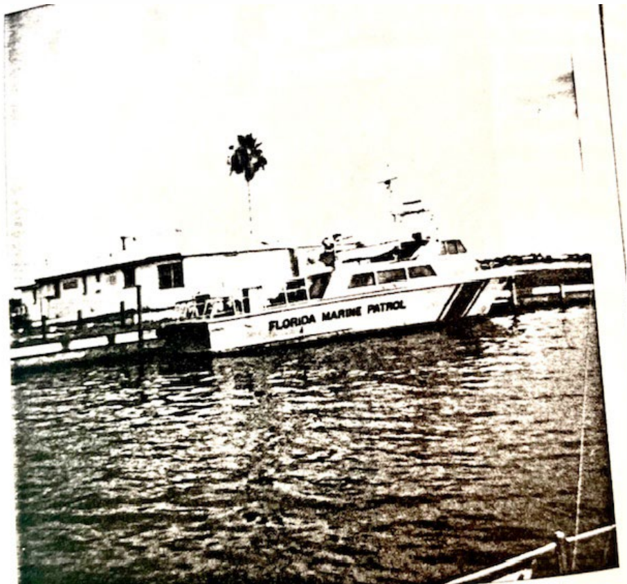
Photos of early construction of Flotilla 716 (top row) the finished product, 1960s. Finished (second row).

Initially, the Flotilla met twice each month in a room provided rent free by the City of Gulfport. But the room was only available if not used by a paying customer. Also, it had no storage for Flotilla equipment. So, in 1962 a plan was created for building a Flotilla building. The estimate for materials needed was $3,000. This money was borrowed from Union Trust Co. and paid back over four years at $2/month/member. On July 31, 1962 the Flotilla was incorporated with the state as the Gulfport Marine Training and Rescue Group, a non-profit.