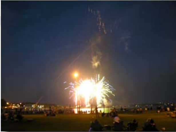
The fireworks display on the Williams Pier in Gulfport.

On July fourth the city of Gulfport celebrated Independence Day with a parade, street fair and its renowned fireworks display. From the Williams Pier that jets out into Boca Ciega Bay, the city of Gulfport launches its 30 minute aerial pyrotechnics display over the water while hundreds watch from the beach and nearby parks. Dozens of vessels stream into the bay as well to watch the event keeping a 7-16 patrol busy warning boaters with swimmers in the water to display a dive flag and others to display proper lights on their vessels.