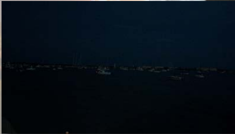
The patrol had its work cut out for them as dozens of vessels streamed into Boca Ciega Bay to watch the firework display from the Williams Pier and nearby St. Pete Beach.