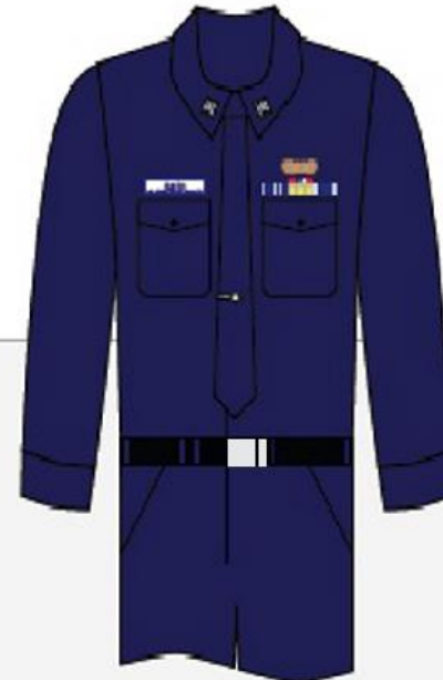
WINTER DRESS BLUE