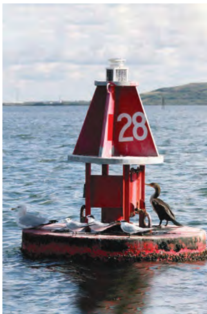
ATON in Tampa Bay.

We hope to see a few more interested people soon.