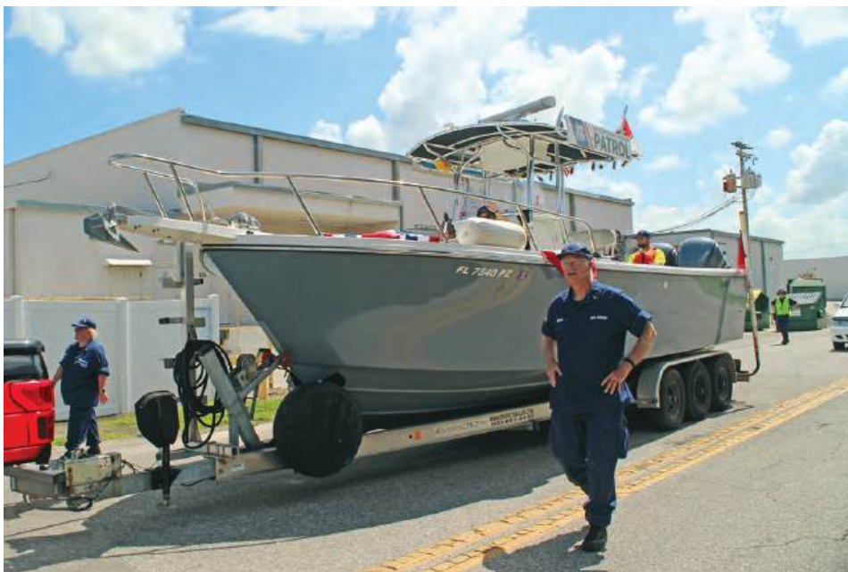
Flotilla 74 facility 'Miss Daisy' serves as a float in the Brandon Independence Day parade. Members from four Division 7 flotillas.

currency for crew and coxswain training in our area. There are several missions scheduled for C-127 drops this month to work with Station Sand Key.