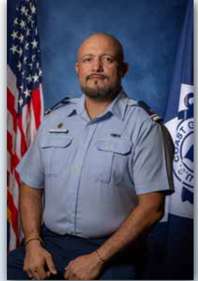
Gustavo Montano, SO-PB 070-06, Photo by Gustavo Montano