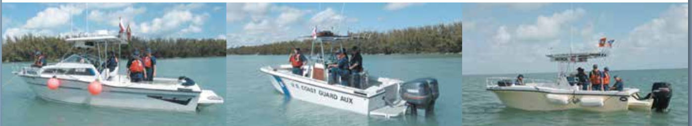
Photo opportunities aboard the SPC-LE will be strictly at the Coxswain's discretion and contingent upon weather conditions.

RSVP by January 24, 2025. Space limited to first 100 Auxiliarists to RSVP.