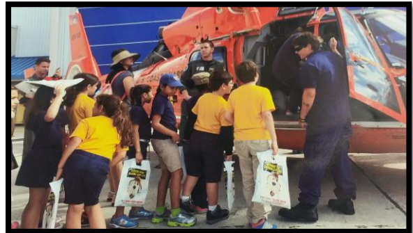
Miami-Dade County District 12 Spring Festival April 18, 2015