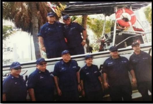
April 11 2015 Bicentennial Park