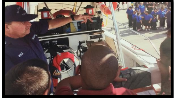
April 17, 2015 Air Station Miami

The Division 6 Communications Team has been very busy during the month of April, let alone the previous months that were not far behind in the work performed. On April 11, there was the Bicentennial Park for the Philanthropist event which included military appearances. Many visitors passed by our display, and boarded the patrol vessel. Adults received a demonstration on communications equipment, and were given brochures and other written materials on Boating safety and information. On April 17, 2015 there was the Air Station Miami event inviting school children to the Air Station in the designated area were Airplanes, Helicopters, tables of information, including our division's Communication Team area with the Patrol Boat and Communications equipment, including the tall antennas. On April 18, 2015 Miami-Dade Commissioner Jose "Pepe" Diaz visited the Communications display at the Spring Festival.