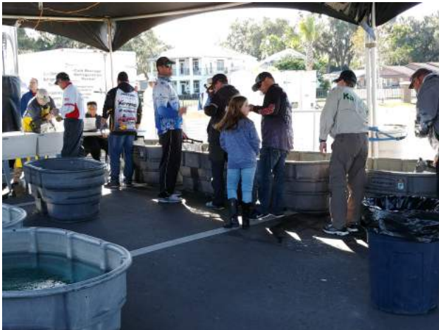
Boating Safely and the Community

We are pleased to announce that we are again offering the Boating Skills & Seamanship course at Lake Tech College in Eustis which began this month and will continue until May 22 nd . This 13 module course is a must for all serious power boaters. Last year's class included three married couples who enjoy weekend boating as well as extended cruises. Classes are being held on Wednesday evenings from 6:30 p.m. to 9:30 p.m.