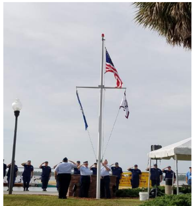
Antique Boat Show – Our History – 2017

https://training.fema.gov/is/searchis.aspx?search=pds