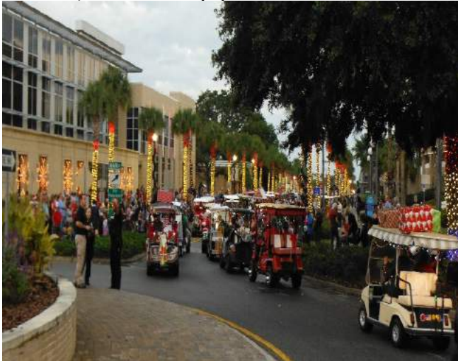
The flotilla float followed over twenty decorated golf cart in the Tavares Christmas Parade turning in the round-a-out near the Lake County Court House on December 1, 2018

The parade not only gives our flotilla a chance to be a part of the community, but to remind all viewers that we are there when it comes to boating safety; public education, vessel examinations, search and rescue, and safety patrols.