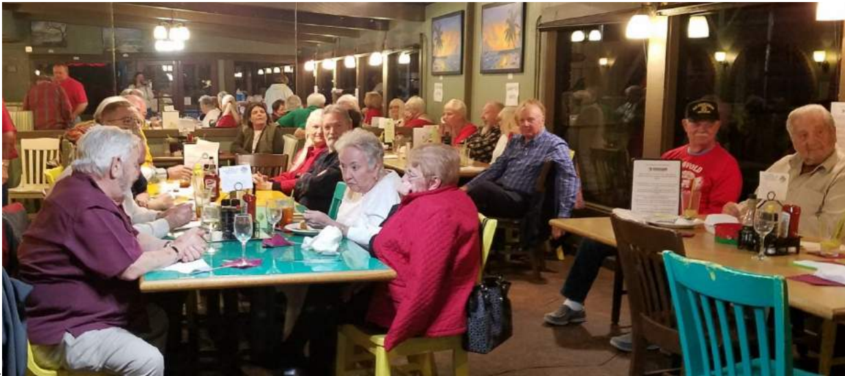
Flotilla 43 Christmas Party at the Fish Camp Restaurant on Lake Eustis