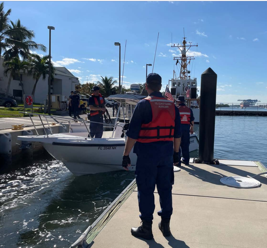
Cover image: The Auxiliary boat crew arriving at Fort Lauderdale Station and preparing to assist in ferrying hundreds of Scouts and staff across the waterways during the Barefoot Mailman event on February 3, 2024.