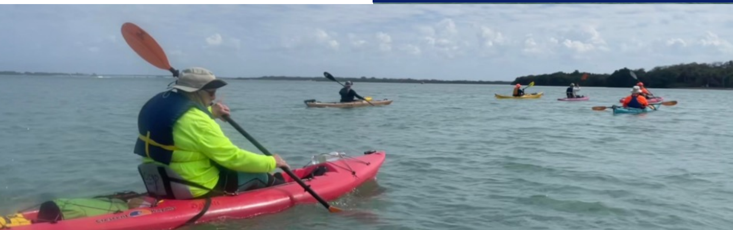
Students practicing the skills they learned during the Winter AUXPAD training at Fort DeSoto (February 2024)