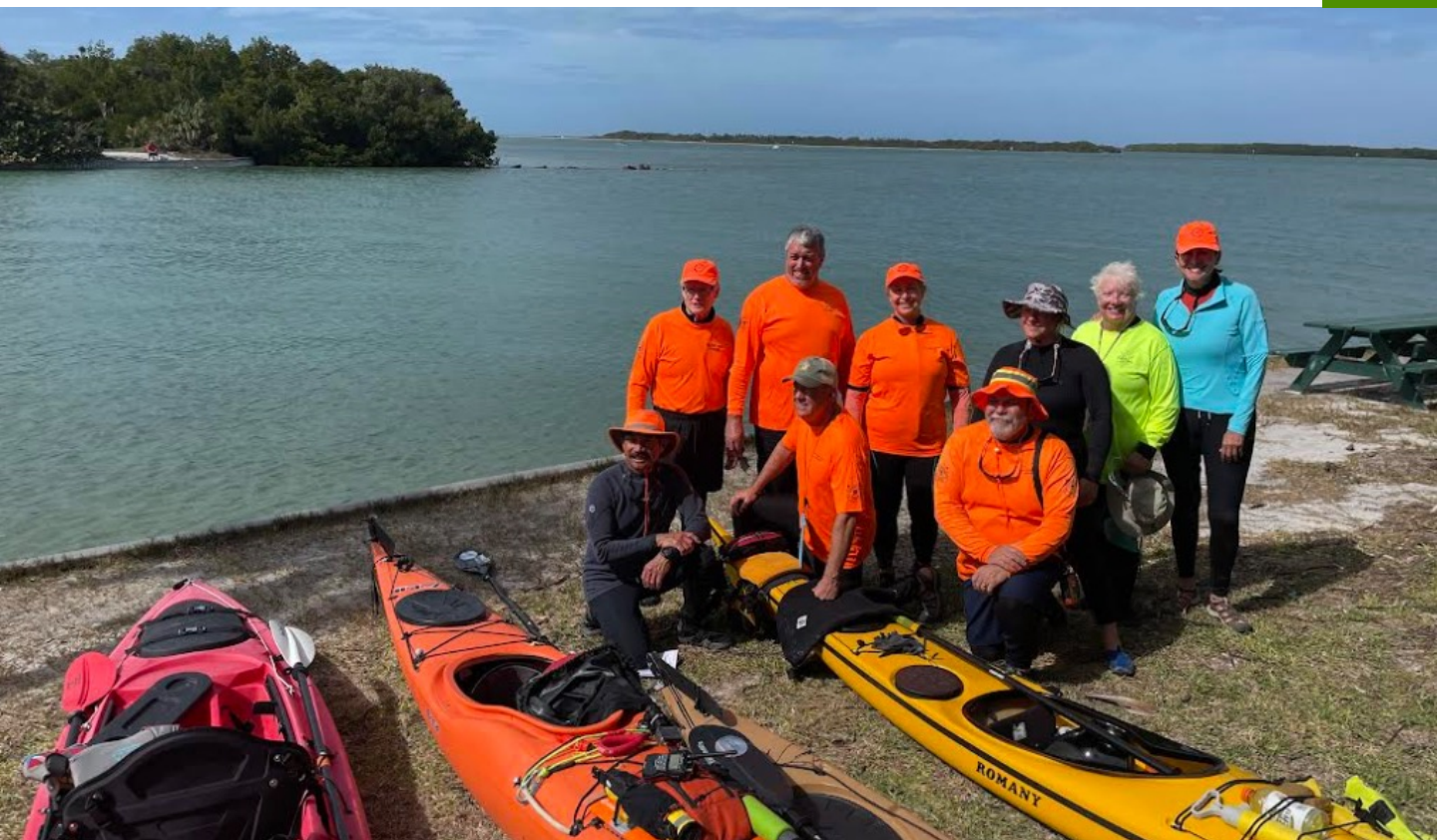
Students at the Winter AUXPAD