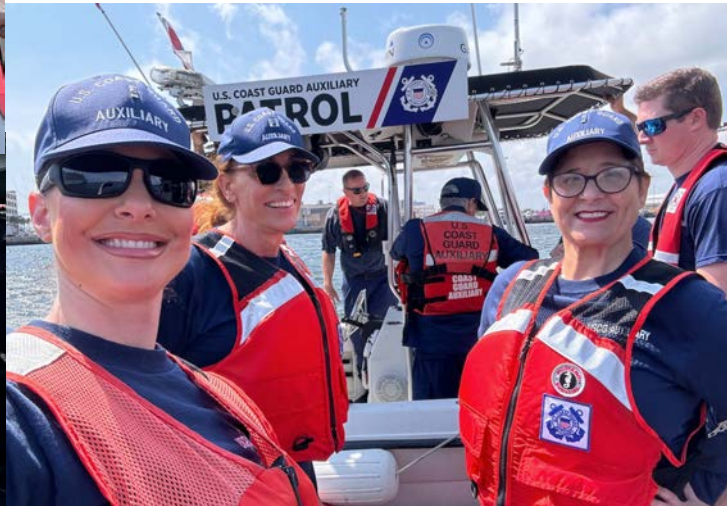
Auxiliarists from Division 3 practice hands on training during boat crew class