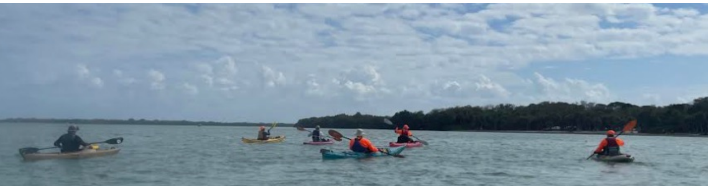
Students practicing the skills they learned during the Winter AUXPAD training at Fort DeSoto (February 2024)

Among the many skills we learned and practiced during the AUXPAD training, one message remained consistent: safety in the water is paramount. Throughout the training, we practiced the use of safety and towing equipment, learned how to do self-rescues, as well as, assisted rescues and much more. Although I have been kayaking for years, the self rescue was a new experience. I have never fallen off a kayak before. As part of this training, I had to purposely flip my kayak upside down and submerge myself in the water. Luckily, we were in safe conditions and under constant supervision (and I, of course, had my life jacket on). As I entered the cold water, I have to admit I gasped. It was much colder than I thought, even though I had been advised of the temperature beforehand. While in the water, I had to flip my kayak right side up and pull myself in. Flipping the kayak over while you are in the water is not as easy as you may think, and it was something I had never previously given much thought to. Once I flipped it over, I needed to pull myself in, however, there were no handles on my kayak or ropes for me to grab. Using my strength and the techniques we were taught I was able to pull myself aboard. But what happens when someone falls in who