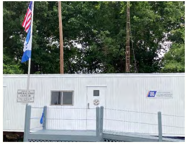
Flotilla 25 Operations Center with a fresh coat of paint.