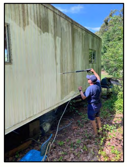
Larry Cole (FC 25) cleaning the Flotilla 25 Operations Center in prep for a much- needed paint job.