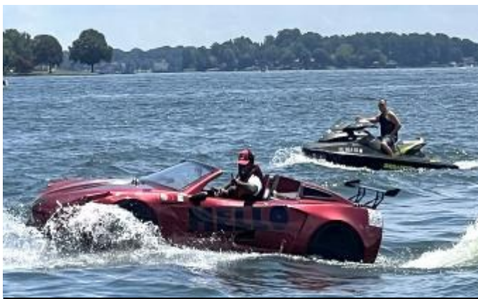
Aquatic car came out for some fun.