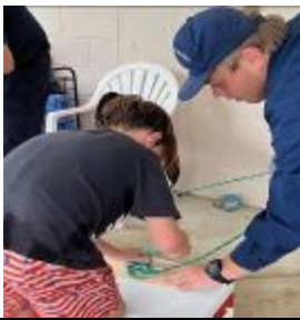
Practicing the cleat hitch.

Auxiliary members experienced with teaching children boating safety put their heads together, consulted the Boats 'n Kids course, the Boat America course, and the content that was already being taught by camp counselors. The allotted time was 1.5 to 2 hours. The instructors presented their plan to Katie and the camp counselors and all gave an enthusiastic go-ahead.