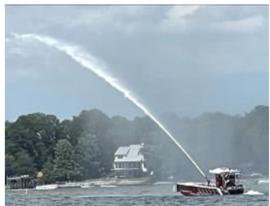
Fire boat training during the day.