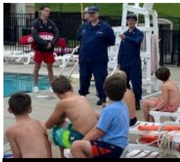
Captive audience for learning about safety on the water.