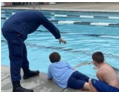
Practicing reaching for water rescue.

A small class allowed for lots of one-on-one teaching. Evaluation of this year's class provided important information related to the ideal number of instructors, the equipment needed and the time required for each activity. The class was well received by Katie and the staff at the YMCA and there is a request to repeat the class at summer camp next year. This endeavor was a win-win for everyone.