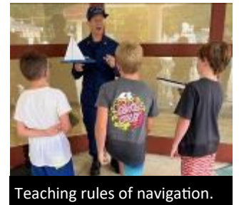
Teaching rules of navigation.

Six instructors spent an awesome 2 hours teaching the children and staff. All appeared eager to learn. The content included knot tying for the bowline, cleat hitch, and clove hitch; navigation rules using boat models; water rescue techniques such as reach and throw; differences in life jackets, and the correct response if a canoe capsizes.