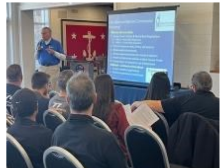
Persons who provide rental boats learn about new regulations on Lake Norman.