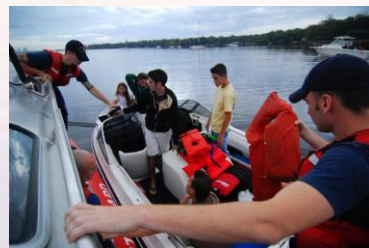
VESSEL EXAMINER POLO