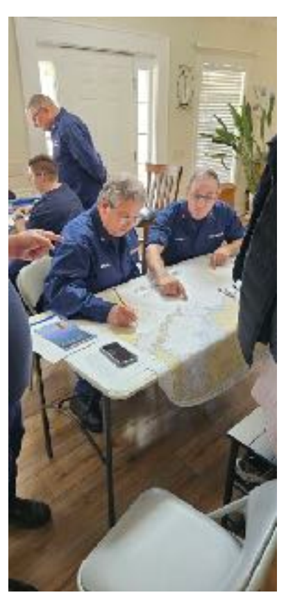
Published by the USCG Auxiliary and no expense to the US Government