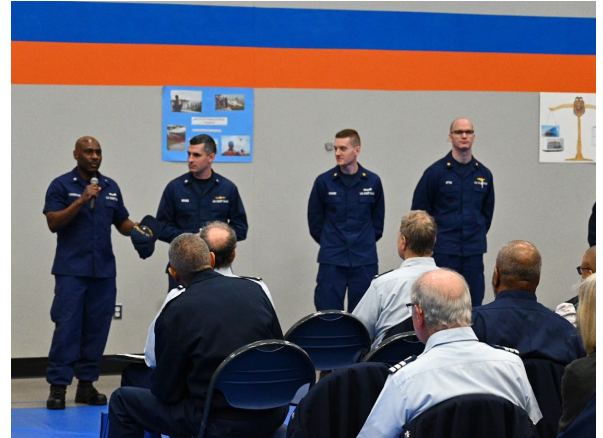
Active Duty and Reserve members of the Coast Guard were present to discuss how Auxiliarists could assist the Coast Guard.