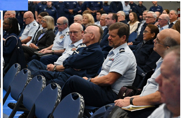
Auxiliary Members listening to the opening remarks.