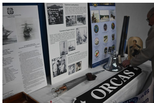
Artifact display from the National Coast Guard Museum.