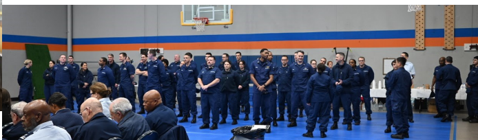
Coast Guard reserves stand by during opening remarks.

The curatorial staff presented an on-site exhibit featuring intriguing items from the Curatorial Services Resource Center, while the Coast Guard provided tours of Sector MD/NCR.