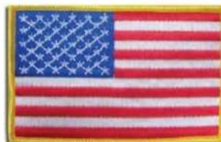
Figure 3 – American National Ensign Patch