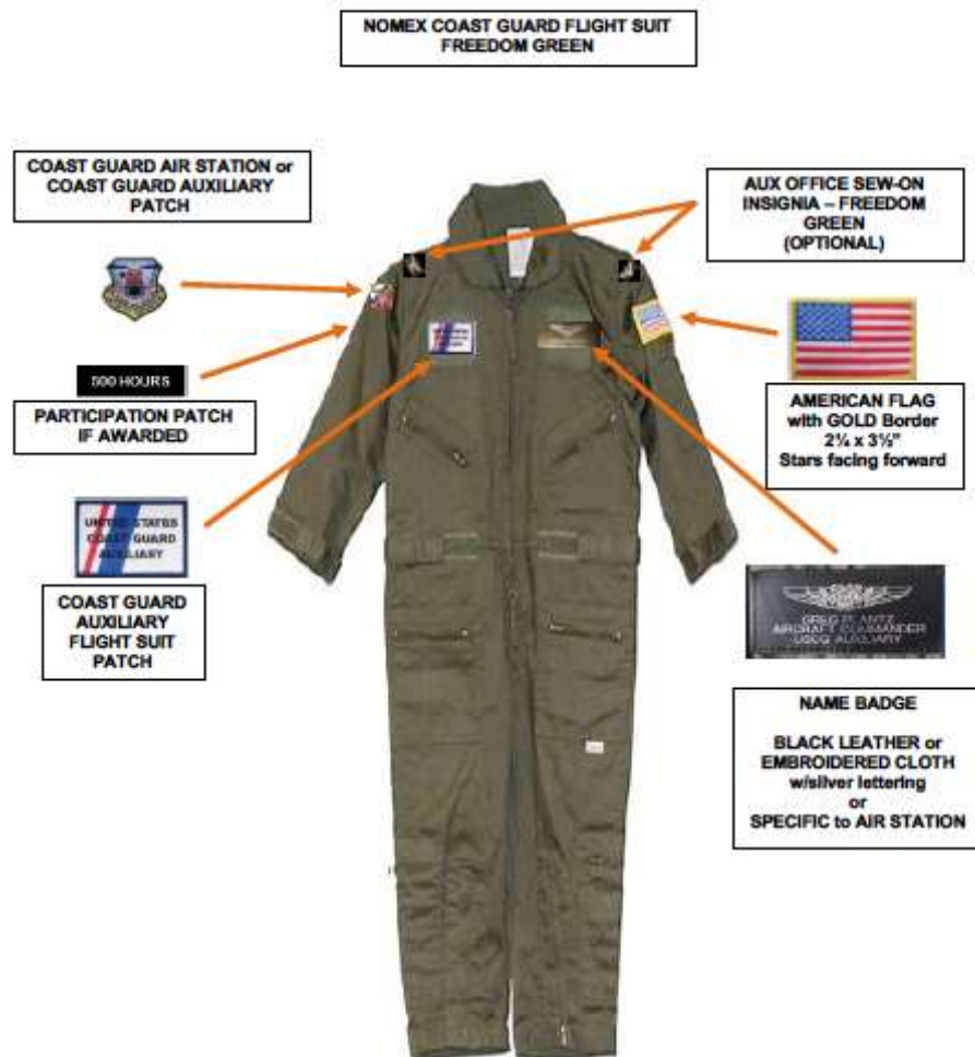
Figure 7 – United States Coast Guard Auxiliary Flight Suit