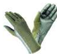
Nomex Flight Gloves