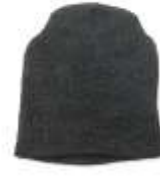
Watch Cap Frigid Weather ONLY