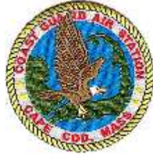
Figure 4 – Air Station Patch