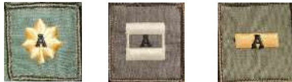
Figure 5 – Auxiliary Office Insignia