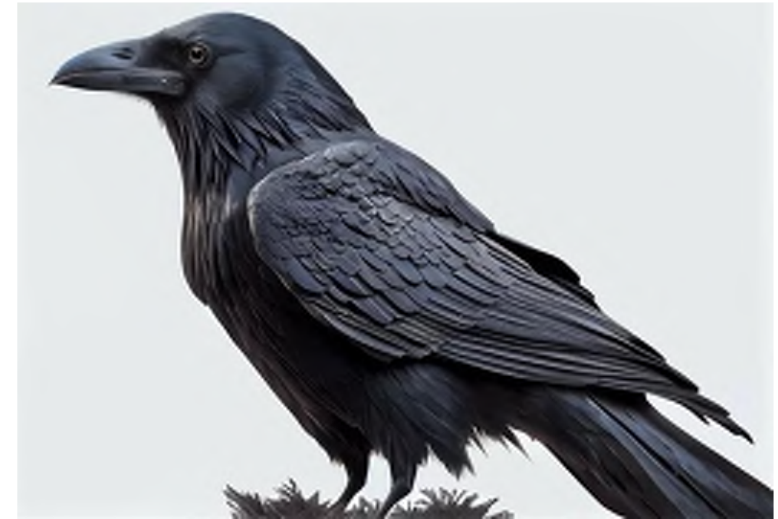
Nunquam Paratus - Nevermore