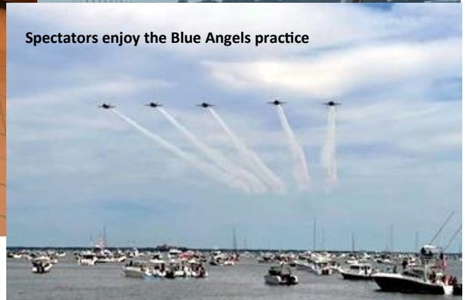
Spectators enjoy the Blue Angels practice