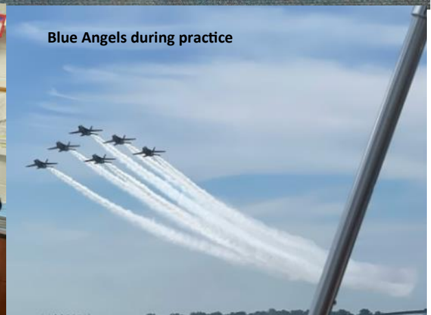
Blue Angels during practice