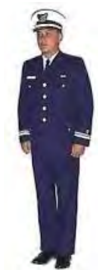
Figure 4 Service Dress Blue Uniform

This uniform may be worn for occasions where the civilian equivalent is jacket and tie. Most flotilla members do not buy Service Dress Blues until or unless they regularly attend functions for which the uniform is required. Because this “Quick Guide” is intended for new members, it does not cover purchasing the service dress blue.