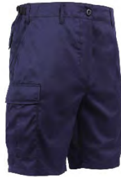
Figure 10 Tactical BSU Shorts

There are no comparable women's shorts, but the men's shorts come in an XS size (28" waist) and the shorts have adjustable waist tabs. Some members wear dark blue shorts or dark blue cargo shorts.