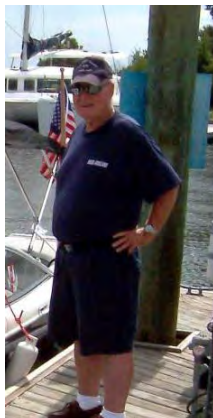
Figure 2 Hot Weather Uniform

Auxiliarists may wear the optional hot weather uniform during summer months only, and only for on-the-water operations or vessel exams. The uniform should not be worn to