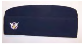
Figure 14 Garrison Cap

Either a Garrison Cap or Combination Cap may be worn. New members usually buy a garrison cap first, as it is much less expensive.