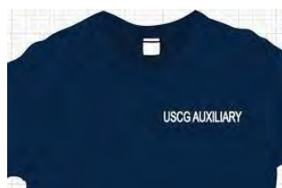
Figure 9 Embroidered Short Sleeve T-Shirt