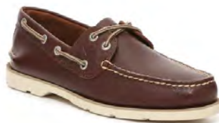
Figure 11 leather boat shoe

SHOES Low cut, dark blue or brown leather boat shoes, or athletic shoes may be worn.