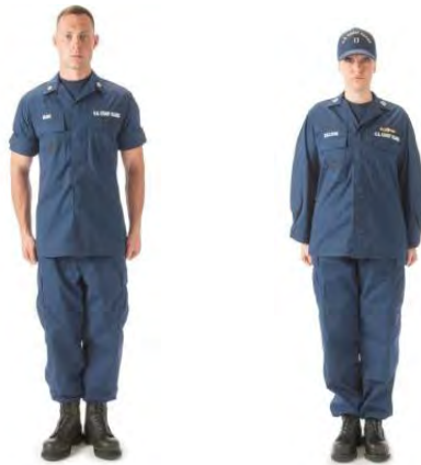
Figure 1 Operational Dress Uniform

This is the most common uniform worn by Auxiliarists and active-duty Coast Guard at Station Oak Island. It can be worn year-round as a field utility uniform and in an office environment. ODUs are the “uniform-of-the-day” for Auxiliary flotilla meetings, training sessions at Station Oak Island, vessel examinations, on-the-water patrols, and some public affairs events. It is recommended that new members purchase an ODU as their first uniform because it is the most versatile.