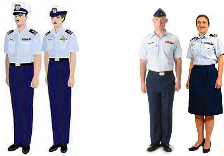
Figure 3 Tropical Blue Uniform

This uniform is worn when a tie is not necessary, and the uniform will not be soiled. Auxiliarists wear Tropical Blues when teaching public education classes, at Division and District workshops and training sessions, Change-of-Watch ceremonies, and many public affairs events.