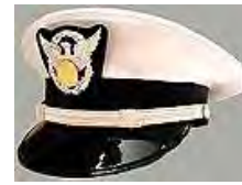
Figure 13 Combination Cap