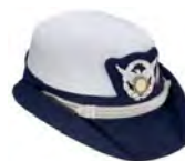
Figure 17 Female Combination Cap