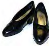
Figure 16 Female pump Dress Shoe

The black women's pumps are plain in style, with no decoration, and made of smooth black leather or synthetic, with a closed heel and toe. The heel may be 1 to 2-5/8 inches high and no less than 1/2 inch wide at the floor. A flat wedge style sole which rises 1 inch is authorized. Sole edges and heels must be the same color as the shoe. Pumps can be purchased from the CGX.