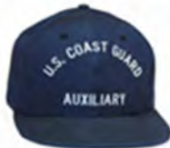
Figure 8 Auxiliary Ball Cap

The price is $11.41 for S and XL, $12.67.for M and L.