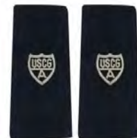
Figure 12 Enhanced Male Member Shldr