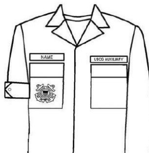
Figure 7 Tape placement locations

Sew this tape on the ODU shirt directly above the left pocket, and it must be the same width as the pocket.