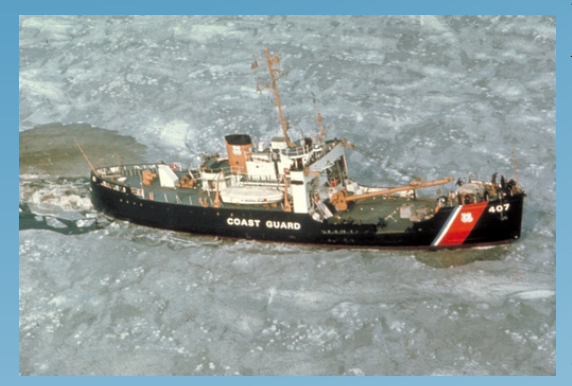
The USCGC Woodrush (WLB-407), Gartrell's first ship, conducting operations