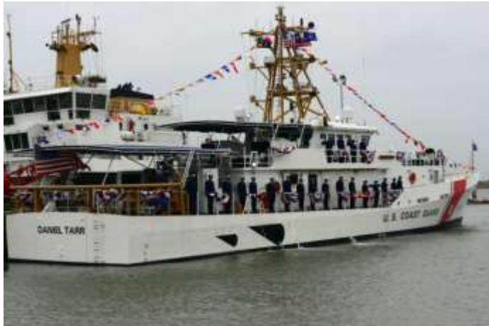
Coast Guard Cutter Daniel Tarr's crew members report for duty during the commissioning ceremony.

For their role in the landing of the Marines' first wave, and capture of Tulagi, the four coxswains were awarded the Silver Star Medal. They were the first enlisted men in the Coast Guard to receive the Silver Star Medal.