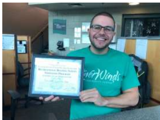
RBS Program Appreciation Certificate presented to the RiverWinds Community Center