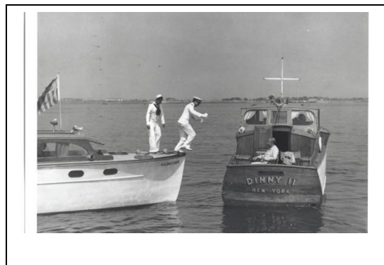
A Coast Guard petty officer and Auxiliarist board a pleasure boat in New York Harbor in 1942.