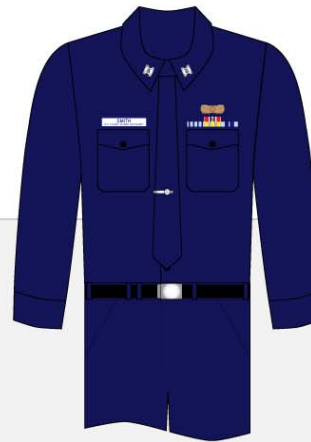
WINTER DRESS BLUE