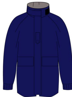
FOUL WEATHER PARKA II