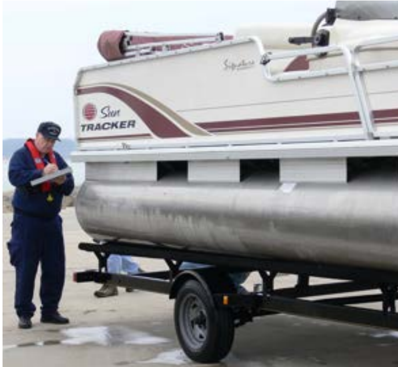
File photo above of CG AUX member conducting a Vessel exam.