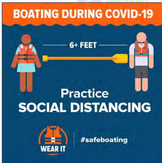
Boating During COVID-19 Social Distancing Infographic