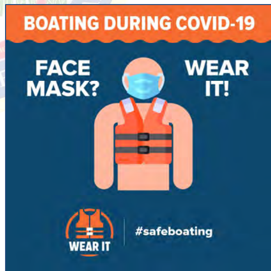
Boating During COVID-19 Wear a Mask Infographic