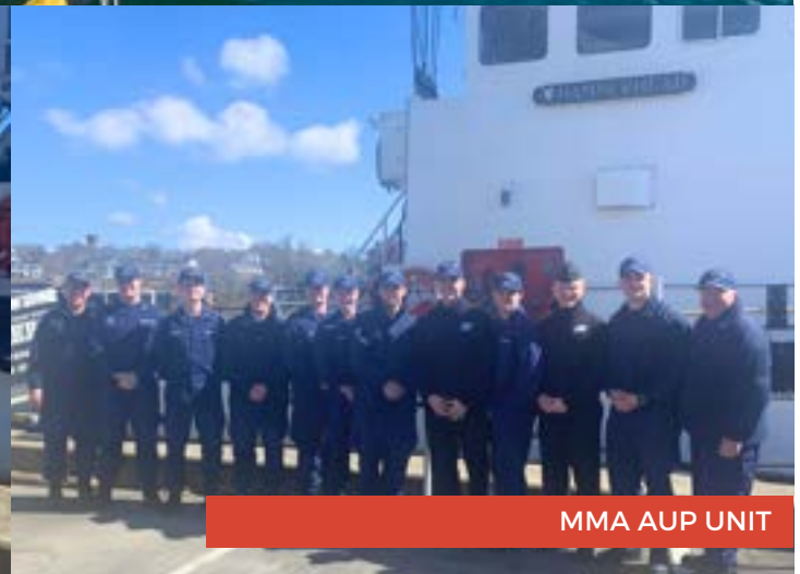
MMA AUP UNIT