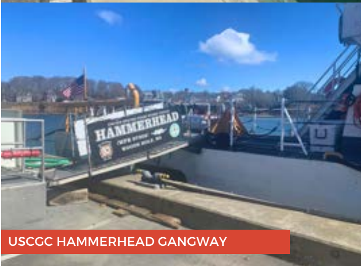
USCGC HAMMERHEAD GANGWAY