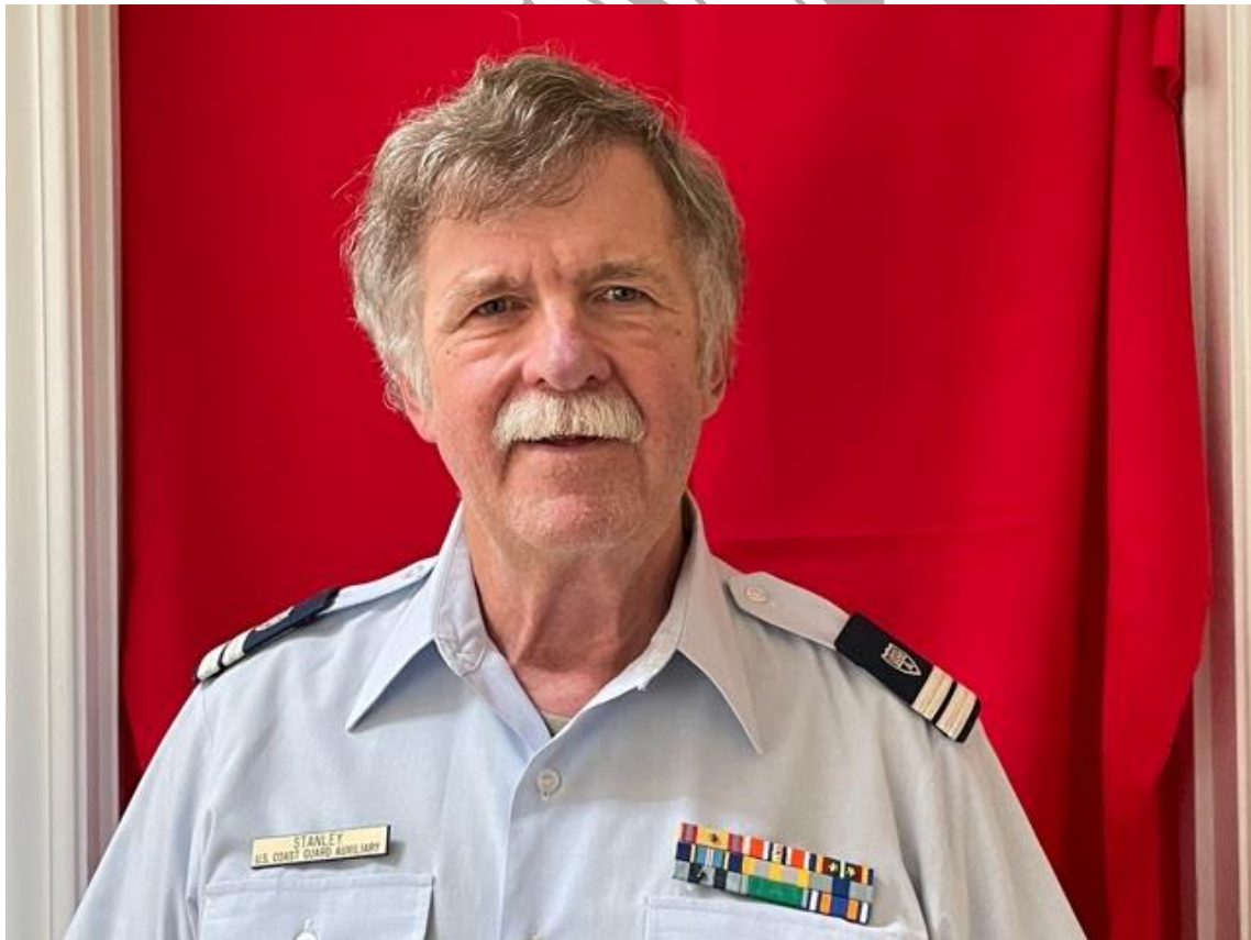
Craig proud of U.S. Coast Guard response to Hurricane Katrina.