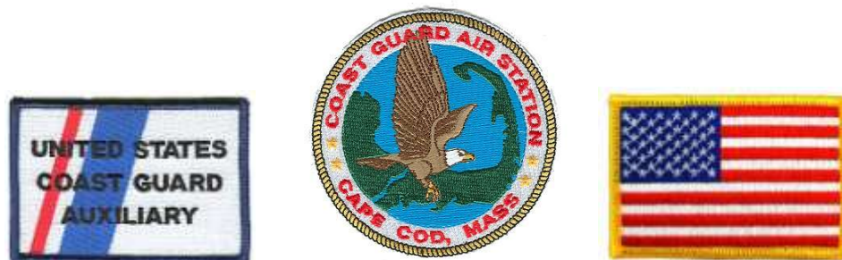
Figure 3. Other Uniform Patches.

Additional required uniform elements include all leather black boots (avoid nylon panels as they melt when they burn), nomex or cotton undergarments only, a garrison cap or ball cap; optional items include nomex light weight gloves, nomex winter gloves and a nomex or leather flight jacket. Online stores like eBay are a good resource for aviation items.