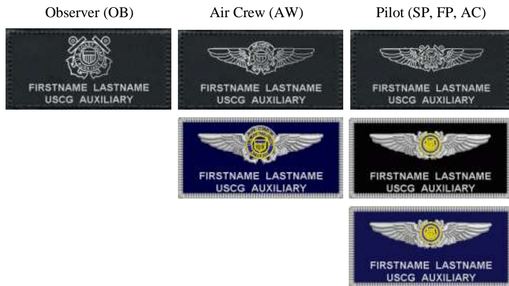
Figure 2. Aviation Name Tags.

Refer to the Auxiliary Manual 16790 (series) for aviation uniform standards. Auxiliarists will be issued a nomex flight suit by the Assistant District Staff Officer – Aviation Materials (ADSO-AVM) but will be required to purchase the flight suit patches (Figure 2 and Figure 3) including: a custom ordered name patch (velcro - left breast), an American Flag shoulder patch (sew on - gold border with star field facing forward on left shoulder), a Coast Guard Auxiliary patch (sew on - right breast) and an Air Station Cape Cod shoulder patch (sew on - right shoulder), all patches other than the name tag are the sew on type.