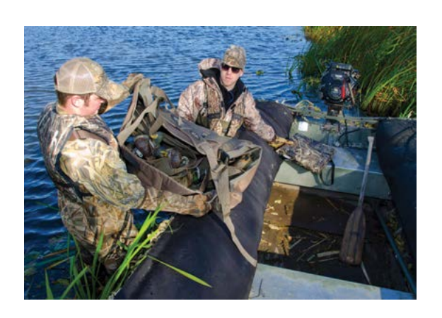
Preparation is the first step in planning a safe hunt.