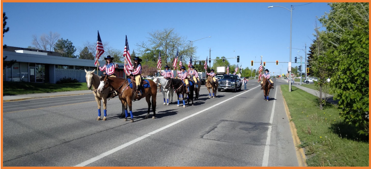
Cowgirls line up at the start of the Memorial Day parade in Bozeman.