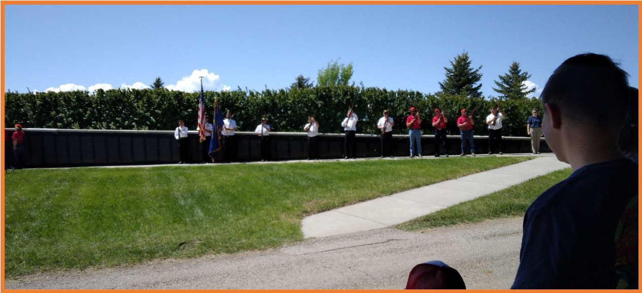
American Legion and Marine Corps League riflemen prepare to fire a three-shot volley in formation at the Vietnam Wall Veterans Memorial.