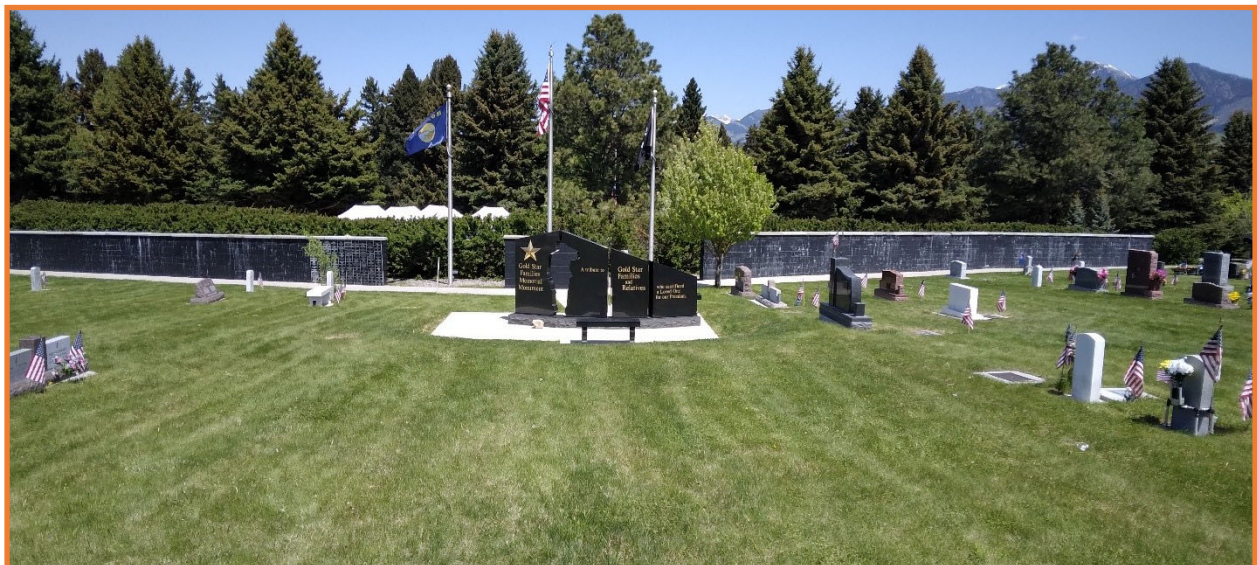
Gold Star Memorial, Bozeman, MT

A Gold Star Memorial service followed the parade at the Bozeman Veterans' Memorial, which is a 1/3 size replica of the Vietnam Wall Memorial in Washington, D.C. Speeches and a solemn reading of Gold Star service men and women names and recognition of their families were accompanied by a three-shot volley by American Legion and MCL riflemen.